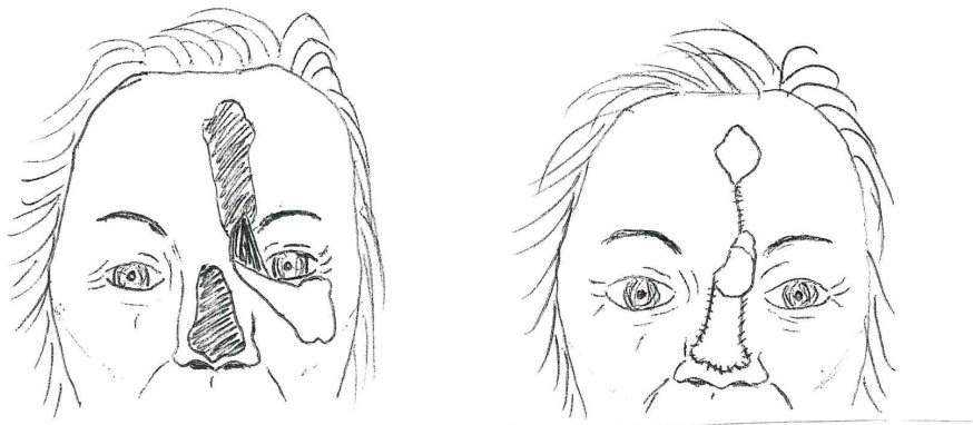
Creating the flap

You may stay in hospital for up to two days after this stage.