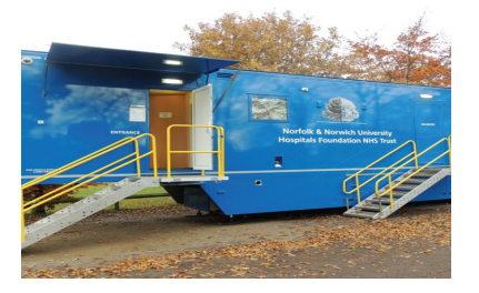
A mobile Breast Screening Van