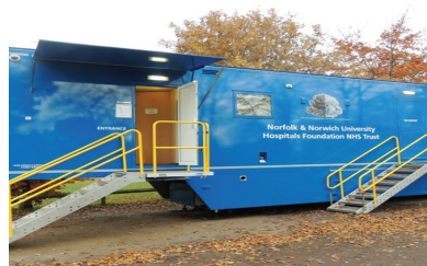
A mobile Breast Screening Van