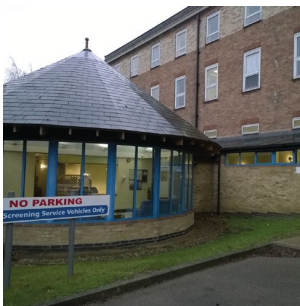
The Breast Screening Unit at the Norwich Community Hospital