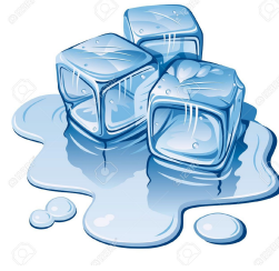
Ice cubes: 15ml each