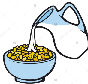
Milk in cereal or porridge