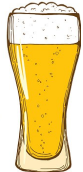
Pint Glass: 568 ml