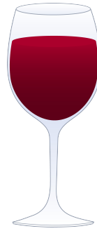
Wine glass: 125-250ml