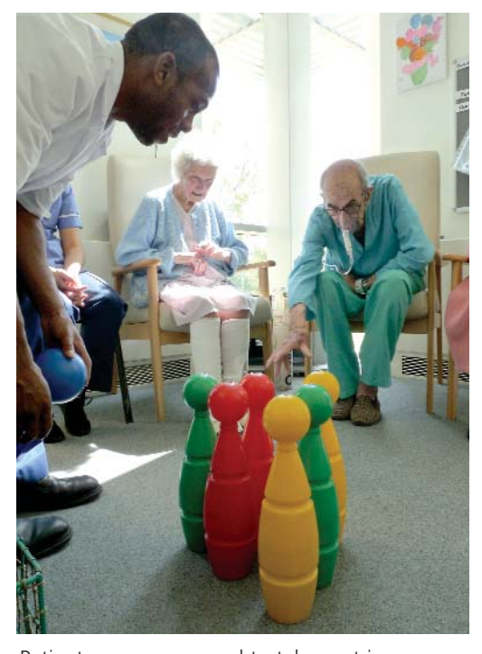
Patients are encouraged to take part in group activities such as chair-based exercises

GOLDEnablement Project team, Medicine for the ElderlySILVERMortuary teamBRONZEBroadland Midwifery Team