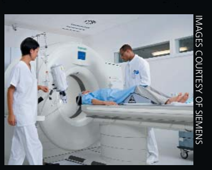
Scans in a Flash Introducing our new generation of CT scanners, p2