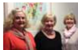
Pictured above: the Sunshine Ladies'