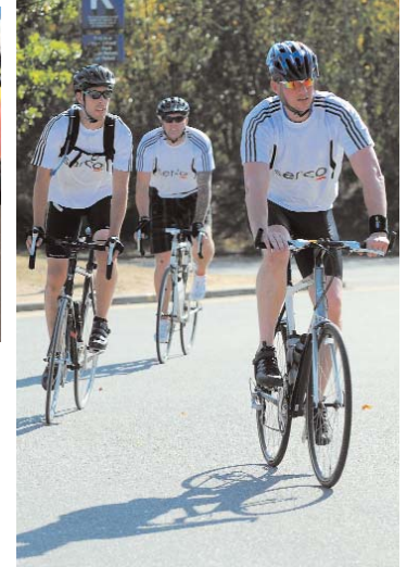
Cool customers: the NNUH 'Docs for Tots' were pleased to raise more than £1,500 (above left) and (above) Team Serco cruise to a stylish finish