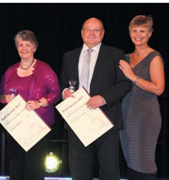
AWARDS NIGHT