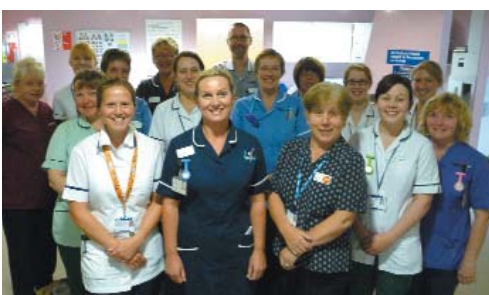
Outstanding teams: The winning Rheumatology Day Unit and Reception team and finalists Denton and Holt (now Kimberley) Wards