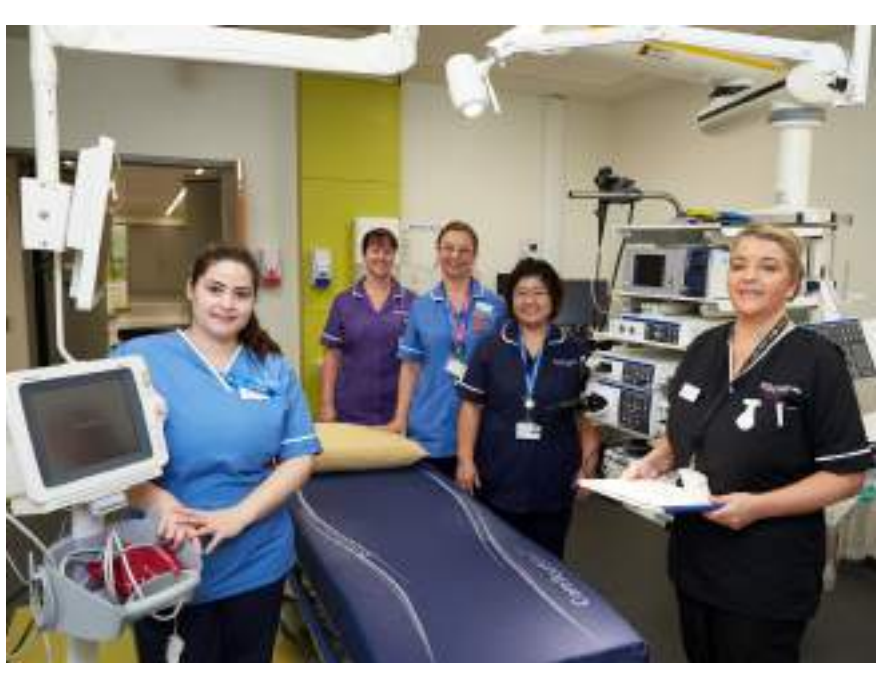
The new state-of-the-art endoscopy centre in the Quadram Institute.

"It will result in quicker access to endoscopic diagnostics for patients and rapid access for the diagnosis or exclusion of gastrointestinal cancer."