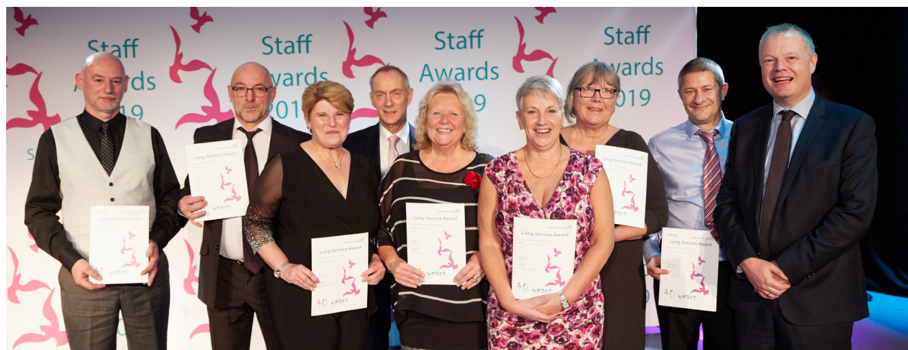
Recipients of the 40 years' service award line up for the camera.