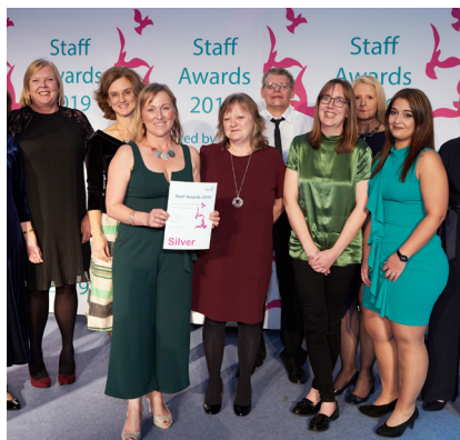
Left: Dilham Ward, top right, Breast Oncology and right Kilverstone Ward