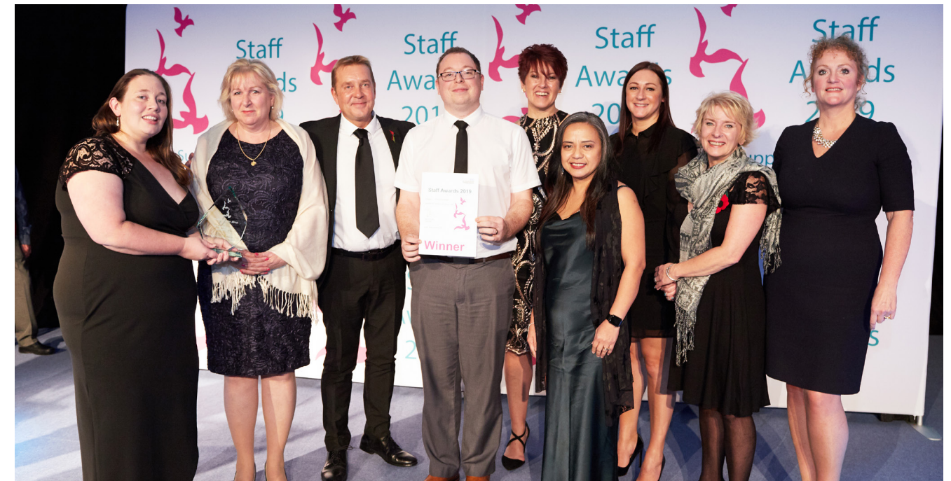
The Partnership Award winners: The Aylsham Discharge Suite.