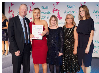
Breast Care team.