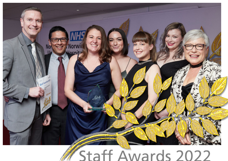
Staff Awards 2022

AiDAPT team who have pioneered revolutionary new technology to improve the care of pregnancy with Type One Diabetes and the Rheumatology research team