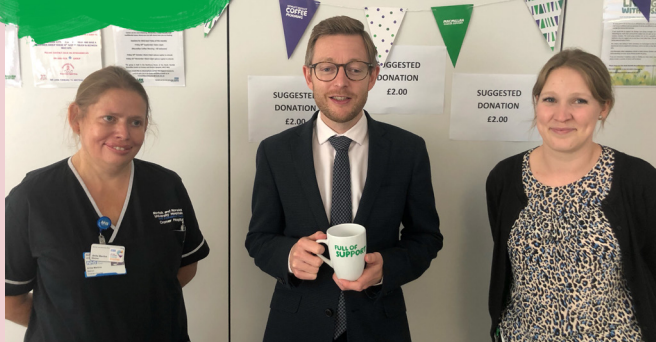
MP Duncan Baker at the Cromer Macmillan Coffee Morning

The North Norfolk Macmillan Centre has provided information and support to more than 300 patients since it opened last year and hosted its first Macmillan Coffee Morning, which coincided with a new cancer support group that runs from 10am to midday on the last Friday of each month.