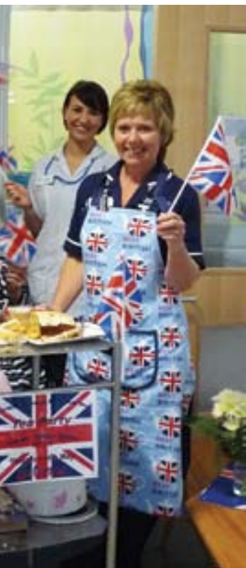
Patients and staff on Elsing ward celebrate the Queen's diamond jubilee with a tea party earlier this year.