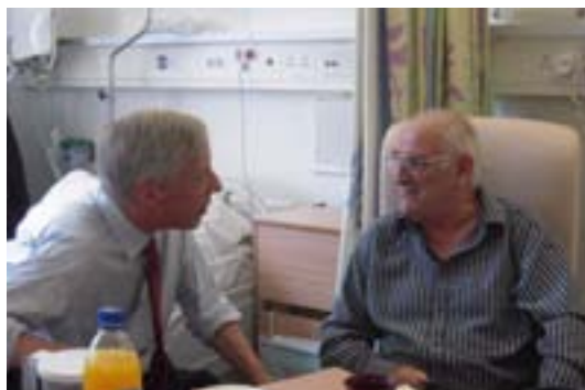
promote the delivery of a high standard of nursing care for older people."