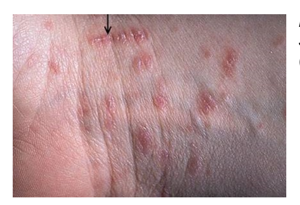
Figure 2: Classical linear burrows with scabies papules seen over the wrist..

The pathognomonic lesion is the burrow: a linear intraepithelial mark which appears slightly elevated and "thread like" (Figure 2). Nodules and papules can also be seen and urticaria can rarely occur.