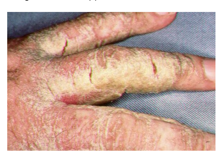
Figure 3: Crusted scabies with more widespread and confluent rash and thicker hyperkeratotic surface with some fissuring seen (PCDS).

If crusted scabies occurs the burrows and rash may be widespread or encompass the whole body. Patients may be less itchy/not itchy due to a reduced immune response (Figure 3). It can be mistaken for other diseases like psoriasis or eczema. Infestation may manifest as: pruritic plaques, patches, faint scale and erythema. Burrows may be seen in unusual sites, but the classic sites as above are also frequently involved. Palms and soles can be affected, and nodules can be seen on the genitals and nipples.