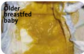
Older breastfed baby

Your baby has cleared all the meconium (see day 1-2) from his/her bowels and all babies of this age should be having at least 2 yellow, soft/runny poos, each of a size to cover a £2 coin, per day. This is a minimum - many babies will poo far more than this! This is nothing to worry about and is a good sign that the baby is getting plenty of breastmilk. Your baby should also be having at least 6 heavy wet nappies per day. Your baby will be weighed around day 5 and most babies lose a little weight, well under 10% of their birth weight, which they usually regain by 10-14 days as your milk supply and your feeding confidence become established.